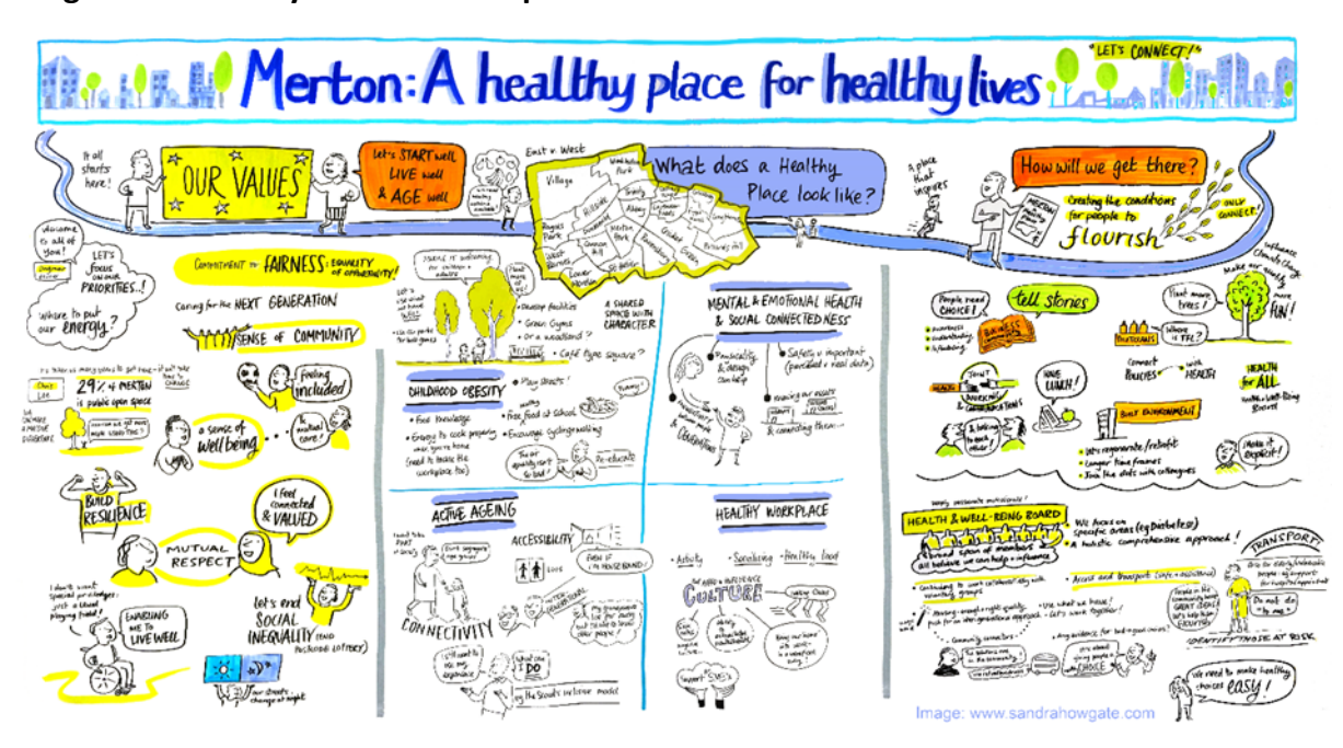
Diagram 4 - Healthy Place workshop illustration

The diagram below is a summary drawing of the findings from our Healthy Place workshop.